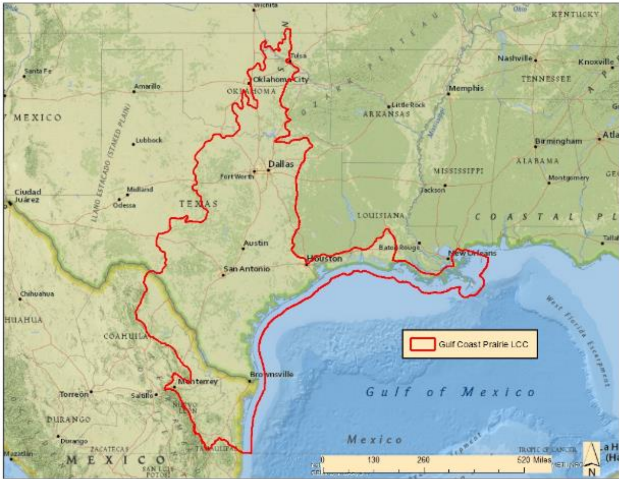
Figure 1: Gulf Coast Prairie Landscape Conservation Cooperative

populations to fall 1980 densities and contained assumptions about carrying capacity of various types of agricultural and forested lands. Theoretically, objectives could be met by improving habitat conditions on many combinations of habitat types. When the GCVJ established Northern Bobwhite population and habitat objectives for the portion of the JV region within BCRs 25 (West Gulf Coastal Plain), 26 (Mississippi Alluvial Valley), and 27 (Southeastern Coastal Plain) the NBCI had been revised and a different objective setting methodology was established. The 2011 NBCI revision used a Biologist's Ranking Index to rank existing habitat value in states in the bird's range (i.e., None, Low, Medium, or High) according to existing Northern Bobwhite populations, existing habitat types, and the potential to increase those populations through management. Empirical data from surveys and expert opinion was used to set an estimated density and a potential managed density by habitat type and quality. However, there are still questions regarding the accuracy of these expert opinion-based density estimates and objectives (William Vermillion, personal observation, Northern Bobwhite Technical Committee Meeting, 2016), and their utility for assessing progress towards national Northern Bobwhite objectives.