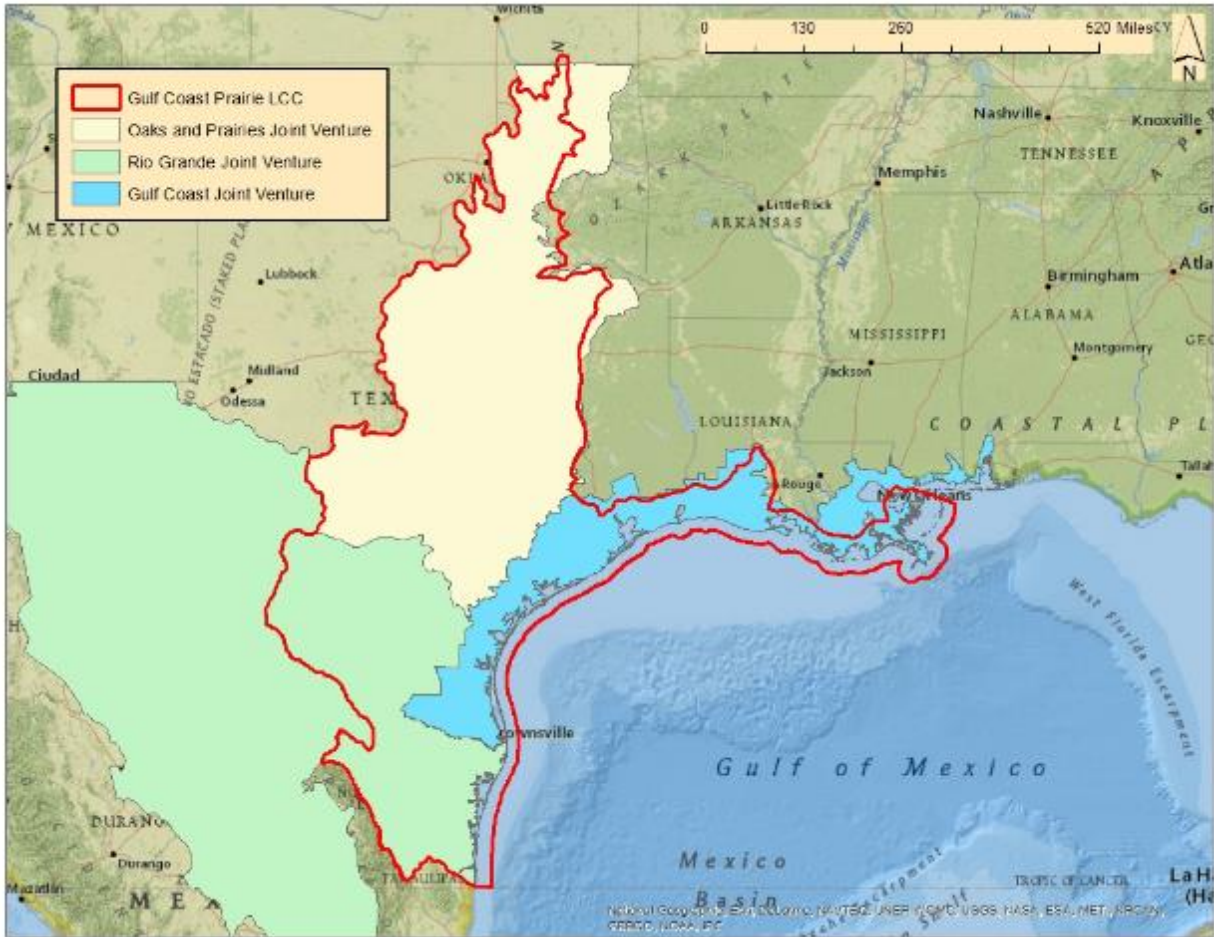
Figure 3: Bird Habitat Joint Ventures in the Gulf Coast Prairie Landscape Conservation Cooperative

population objectives. The RGJV drafted population and habitat objectives for Northern Bobwhite using the OPJV methodology. At the conclusion of the November 2015 meeting, the GCVJ agreed to explore the use of the same methodology to set Northern Bobwhite objectives in hopes of defining a common methodology across the GCP LCC.